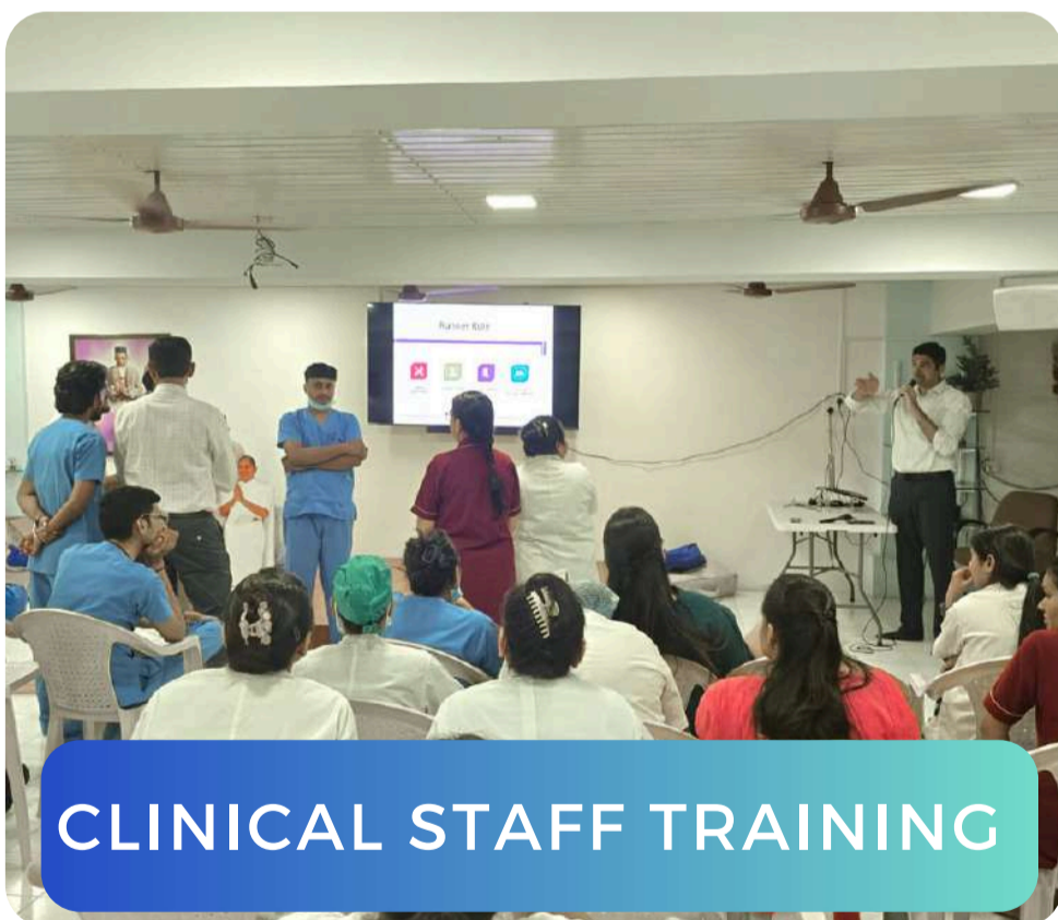
CLINICAL STAFF TRAINING