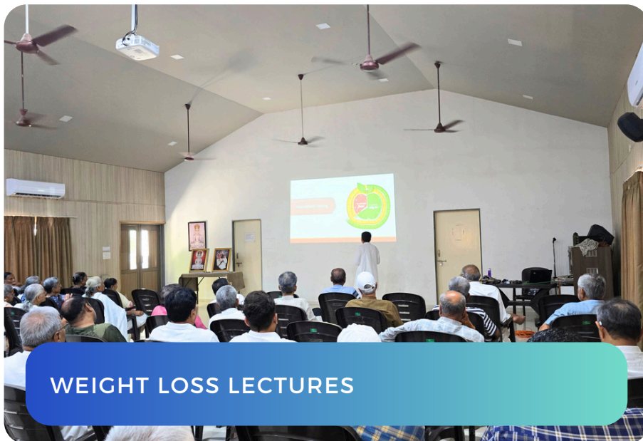
WEIGHT LOSS LECTURES