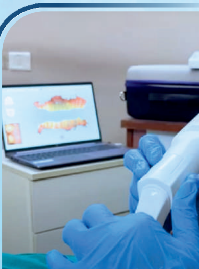
I TERO SCANNER